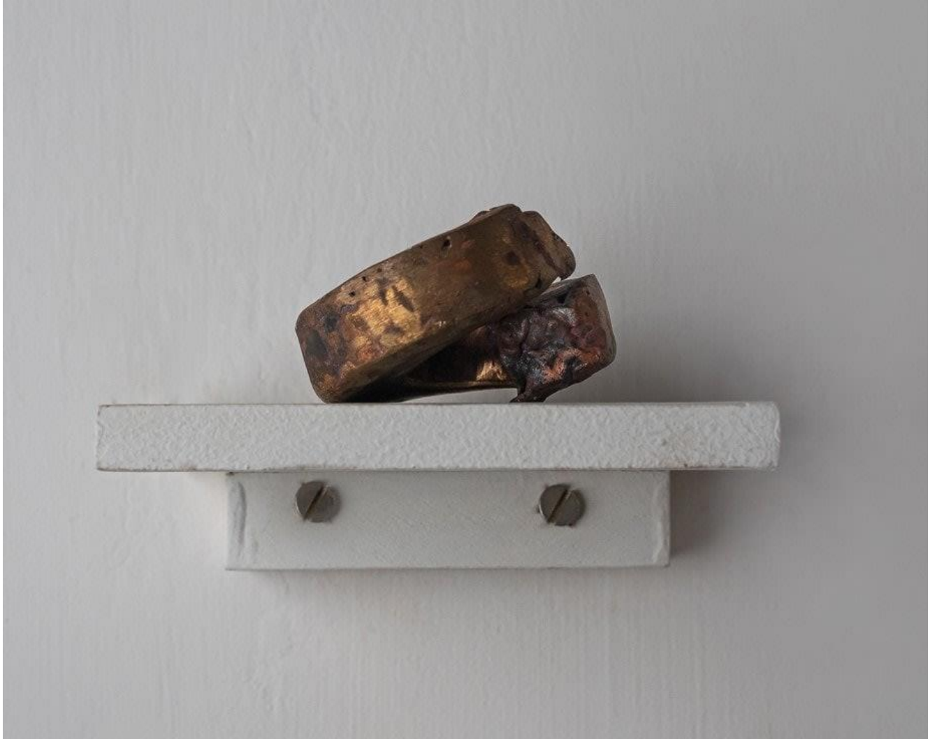
Narayan Sinha Untitled , 2022 Copper 6cm x 13cm x 9cm