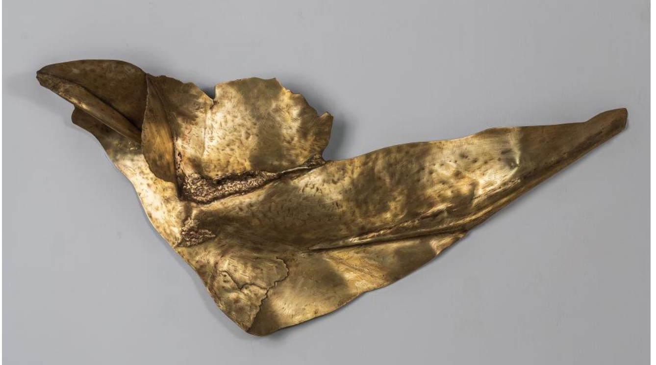
Narayan Sinha Untitled, 2022 Brass 51cm x 104cm x 16cm