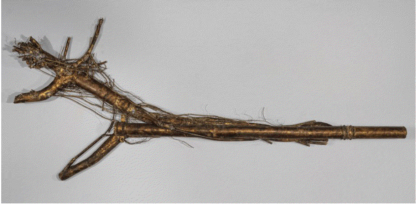
Narayan Sinha Untitled, 2022 Brass 109 cm x 252 cm x 23 cm