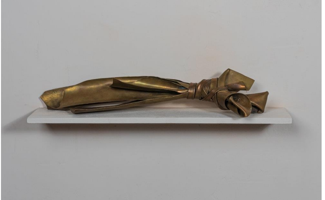
Narayan Sinha Untitled, 2022 Brass 8cm x 42cm x 9cm