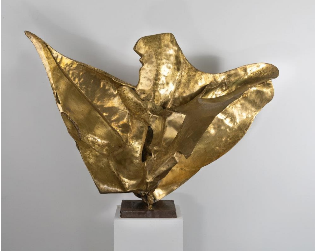
Narayan Sinha Untitled, 2022 Brass 87 cm x 120 cm x 54 cm