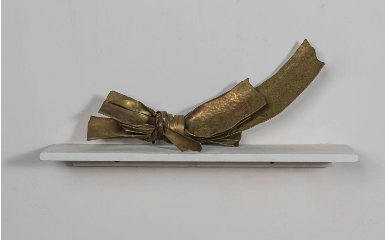
Narayan Sinha Untitled, 2022 Brass 9cm x 33cm x 13cm