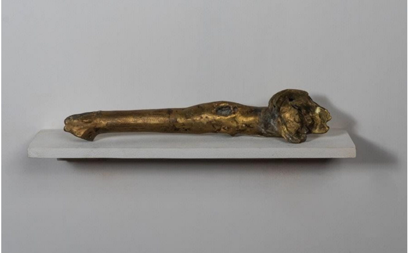
Narayan Sinha Untitled, 2022 Brass 7cm x 32cm x 5cm