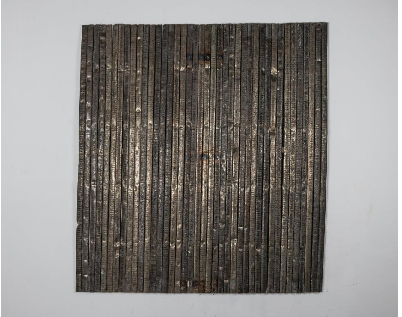
Narayan Sinha Untitled, 2022 Stainless Steel 173 cm x 159 cm x 4 cm