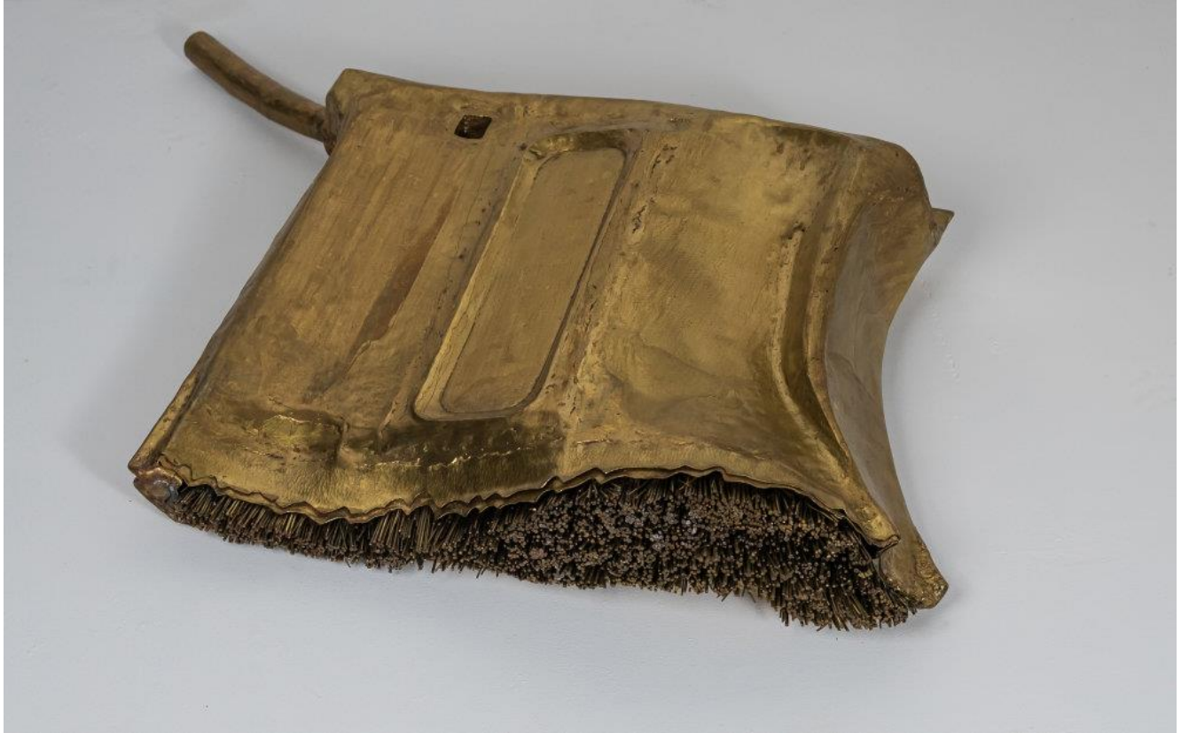
Narayan Sinha Untitled, 2022 Brass 23 cm x 99 cm x 99 cm