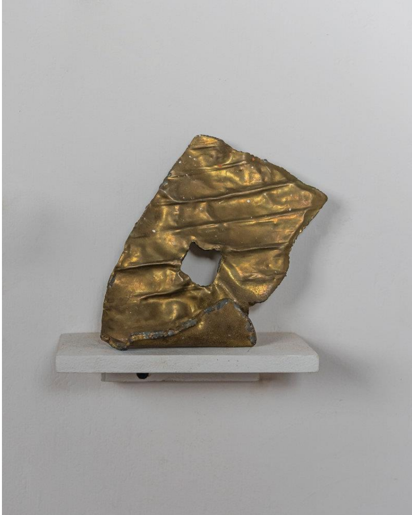
Narayan Sinha Untitled, 2022 Brass 10cm x 15cm x 5cm