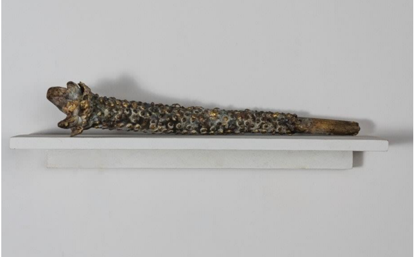
Narayan Sinha Untitled, 2022 Brass 7cm x 32cm x 7cm