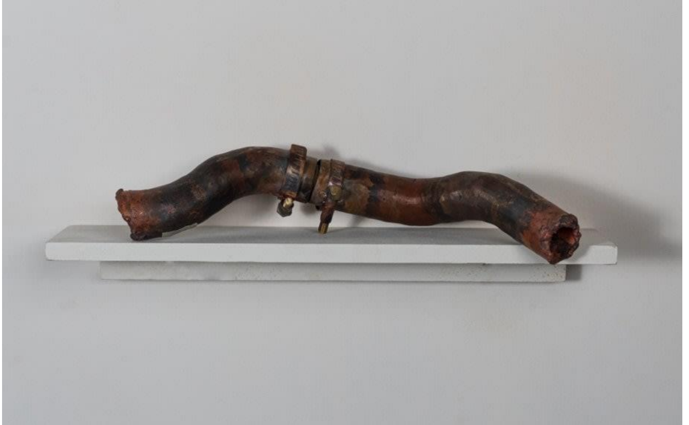
Narayan Sinha Untitled, 2022 Copper 5cm x 30cm x 12cm