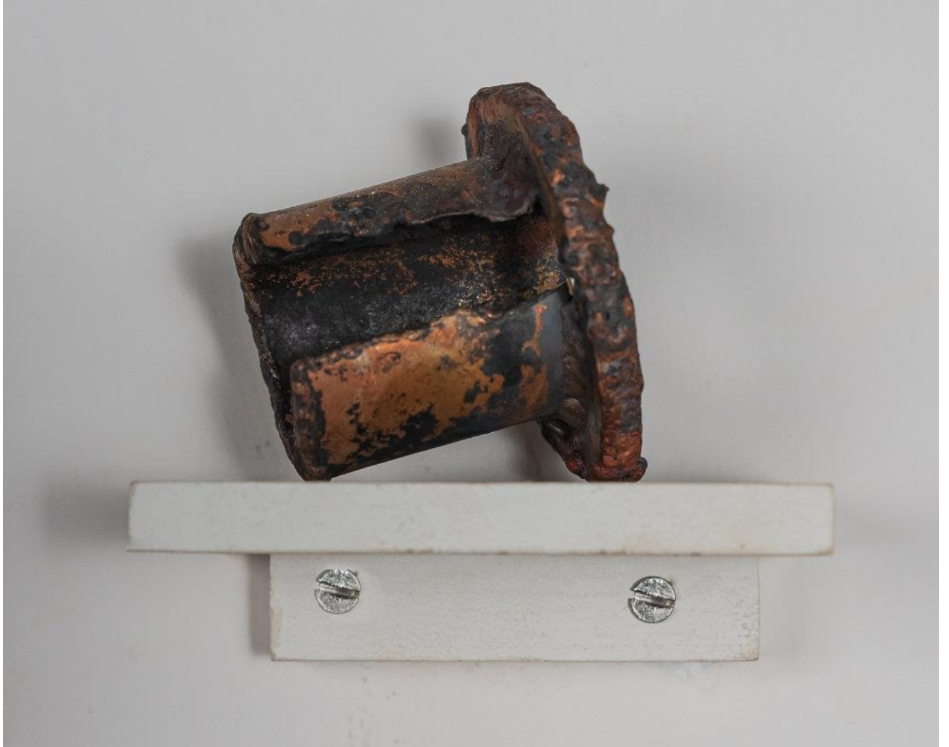
Narayan Sinha Untitled, 2022 Copper 4cm x 7cm x 7cm