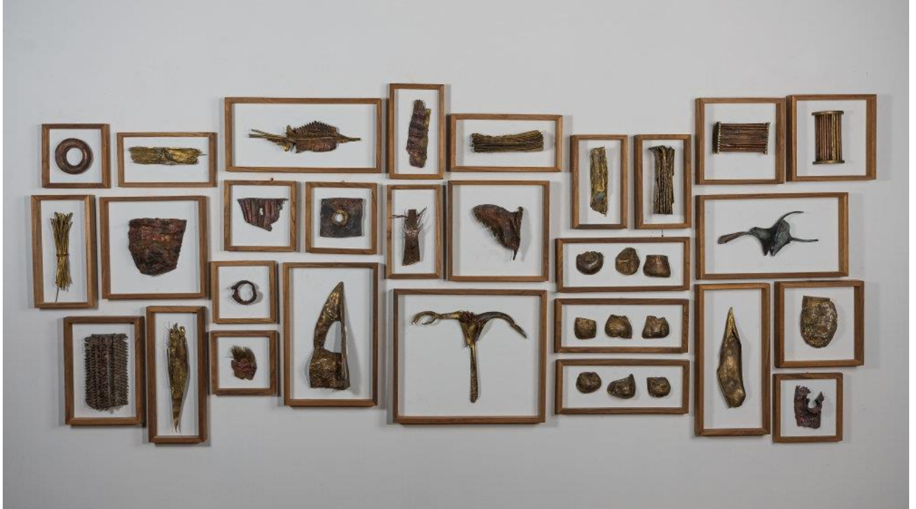
Narayan Sinha Untitled, 2022 Brass, Copper & Steel 244 cm x 92 cm x 2 cm