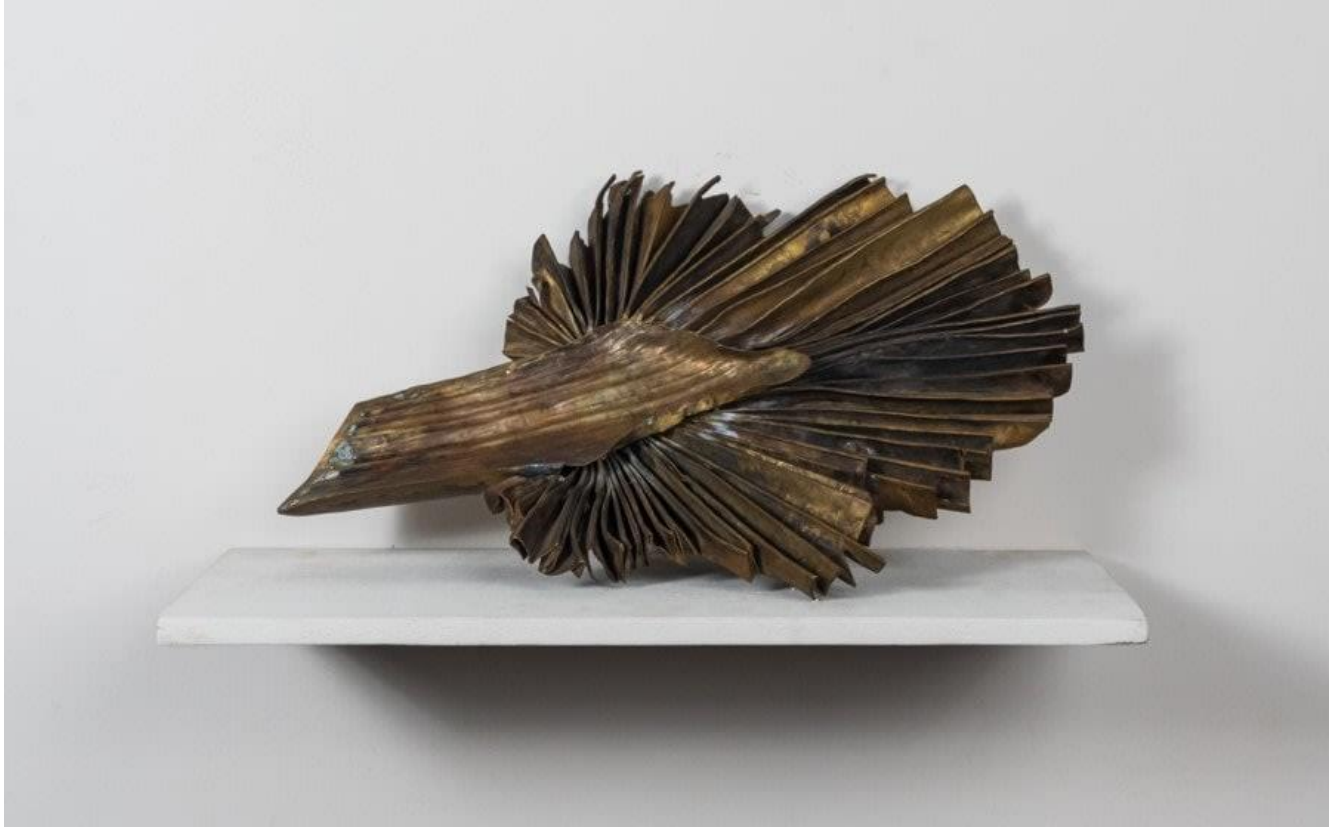
Narayan Sinha Untitled , 2022 Brass 16cm x 39cm x 23cm