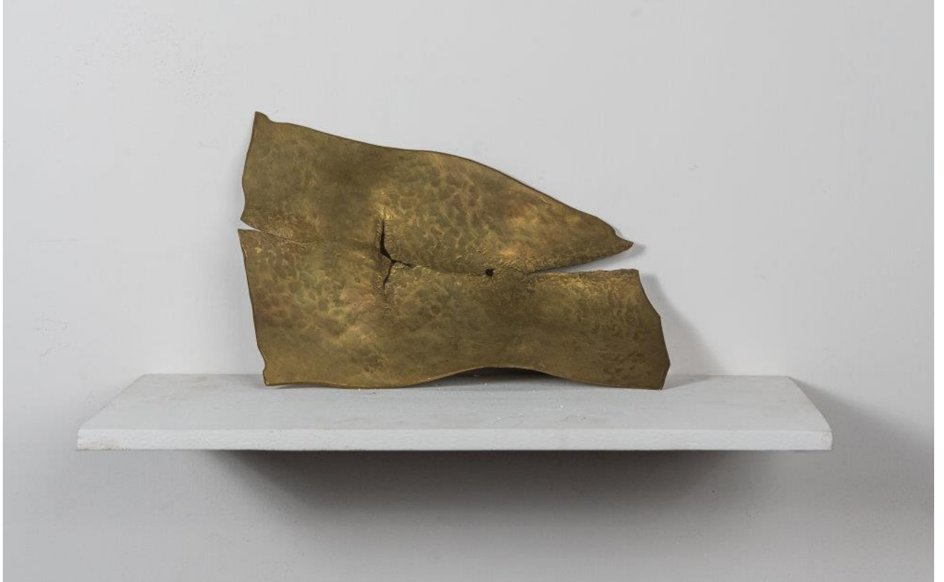
Narayan Sinha Untitled, 2022 Brass 18cm x 28cm x 3cm