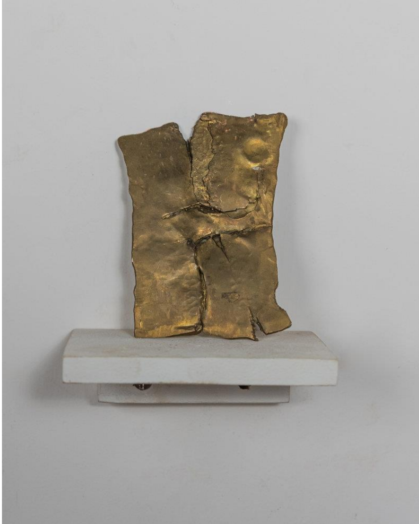
Narayan Sinha Untitled, 2022 Brass 8cm x 13cm x 2cm