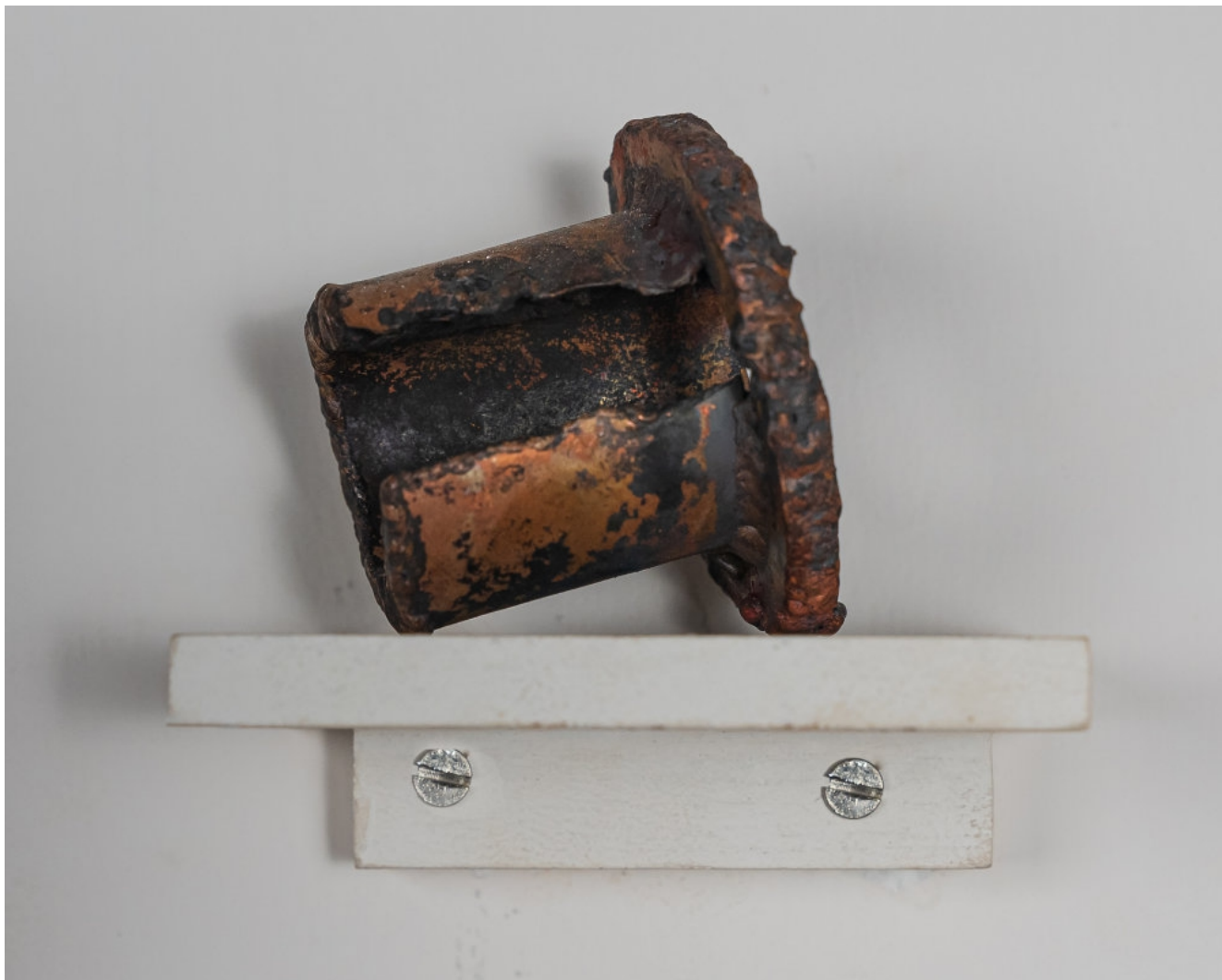
Narayan Sinha Untitled, 2022 Copper 4cm x 7cm x 7cm