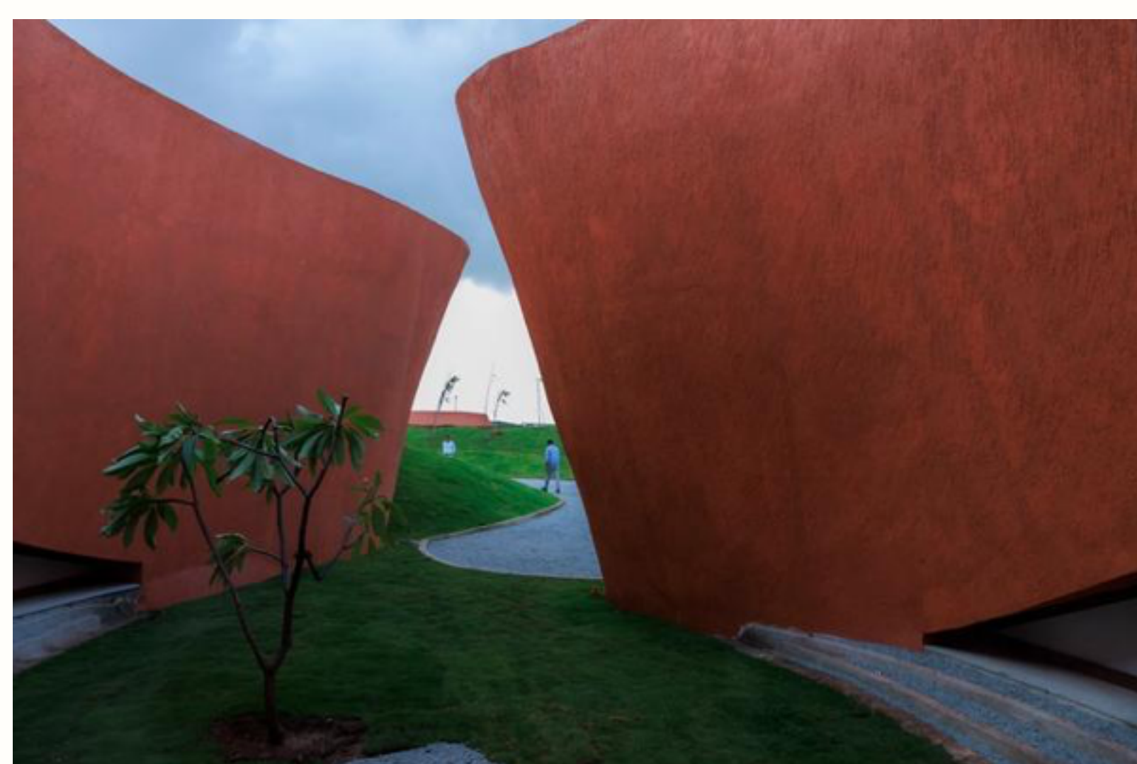
Exterior shot of Hampi Art Labs

The billionaire Jindal family will open the exhibition venue and artist residency space in February next year