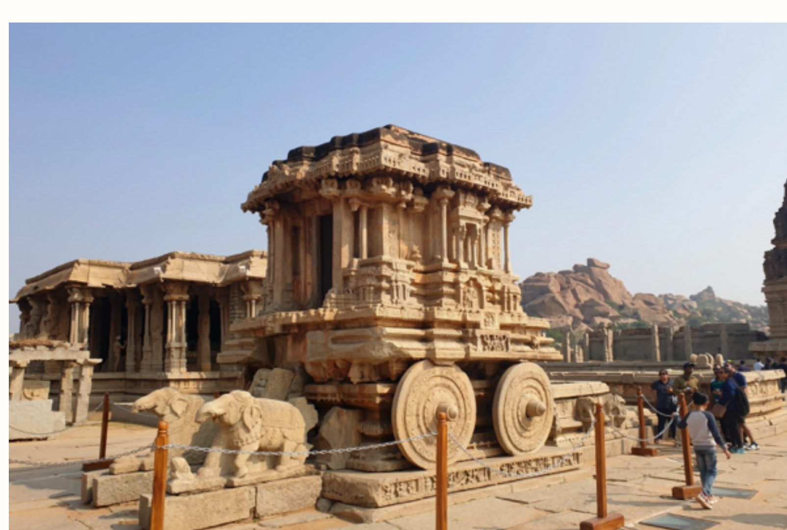
A stone chariot in Hampi

The 18-acre art centre, due to open in February 2024, will be located in a town near Hampi, a Unesco World Heritage site, around a six-hour drive from Bengaluru. A popular tourist destination, Hampi was once the capital of the Vijayanagara Empire, which ruled parts of southern India from the 14th to the early 17th century. During its peak, the empire was one of the world's largest in terms of prosperity and size, and its leaders erected more than 1,000 monuments across Hampi, including intricately carved stone temples, markets and gateways, a number of which remain intact. Tourists also visit the site for its striking geographical position, amid vast boulder formations and on the banks of the Tungabhadra river.